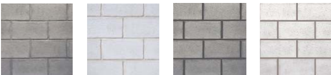
Traditional Washed Grey Traditional Industrial Grey Modern Washed Grey Modern Industrial Grey