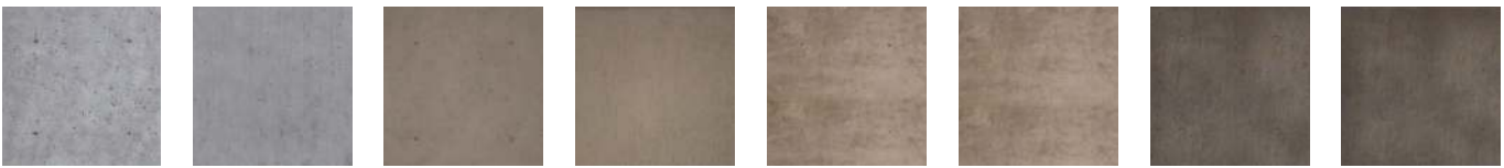
Industrial Grey 'Circles' Industrial Grey 'Flat' Washed Grey 'Circles' Washed Grey 'Flat' Rustic Grey 'Circles' Rustic Grey 'Flat' Onyx Grey 'Circles' Onyx Grey 'Flat'