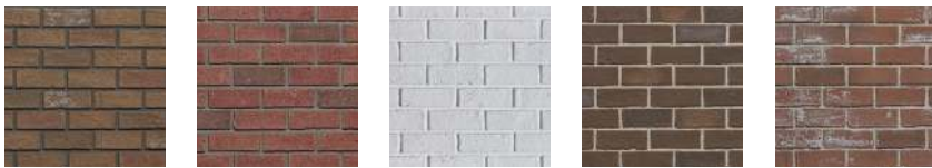
Antique Old Italy Vintage White Cellar Brown Reclaimed Red